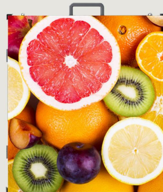
INSscreen COB P1.9

Fully front or rear maintenance available